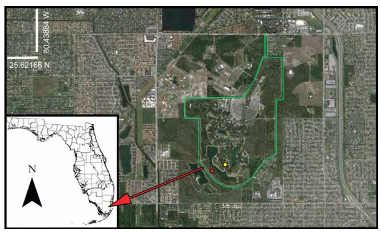
Figure 1. Map of Zoo Miami bounded in green. Note that major roadways, residential areas, and undeveloped protected lands surround zoo property. Dots represents locations of Pituophis found on zoo property; yellow = UF-Herpetology 157954 (gravid female) and red = UF-Herpetology 163092 (adult male).